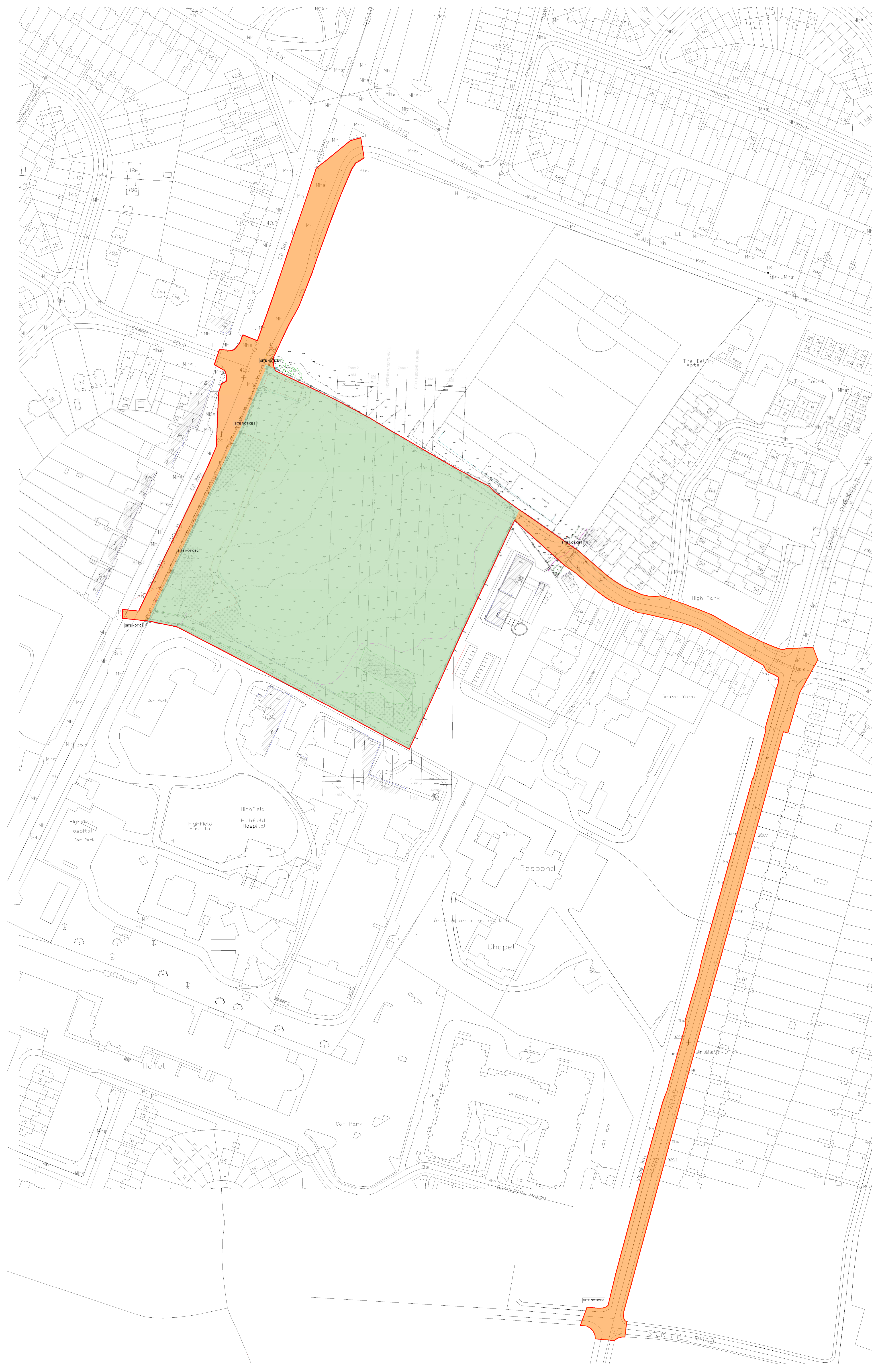
1 Developable Area Map 1:1000